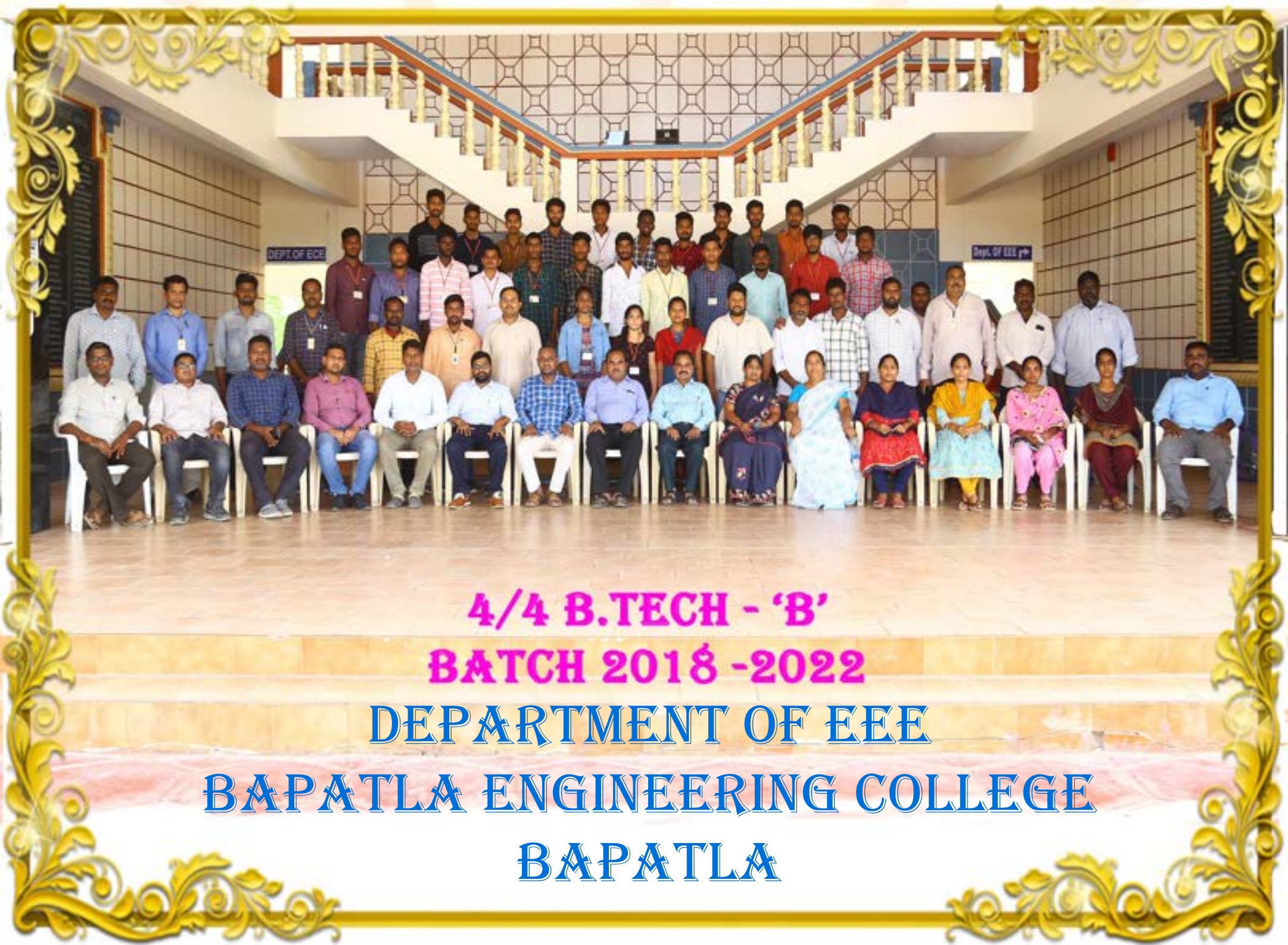
4/4 B.TECH - 'B' BATCH 2018 -2022 DEPARTMENT OF EEE BAPATLA ENGINEERING COLLEGE BAPATLA