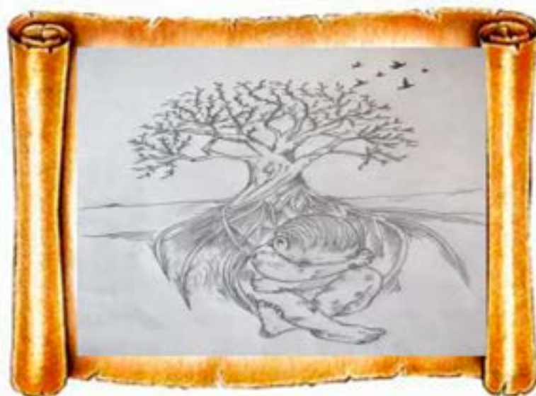
T.Ramagopal 4/4 EEE -C