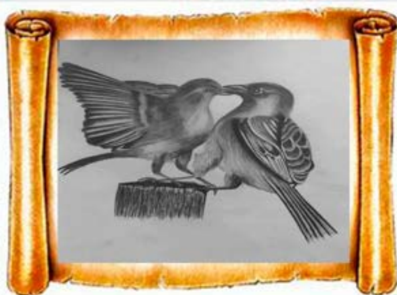
D.Pratap 4/4 EEE -A