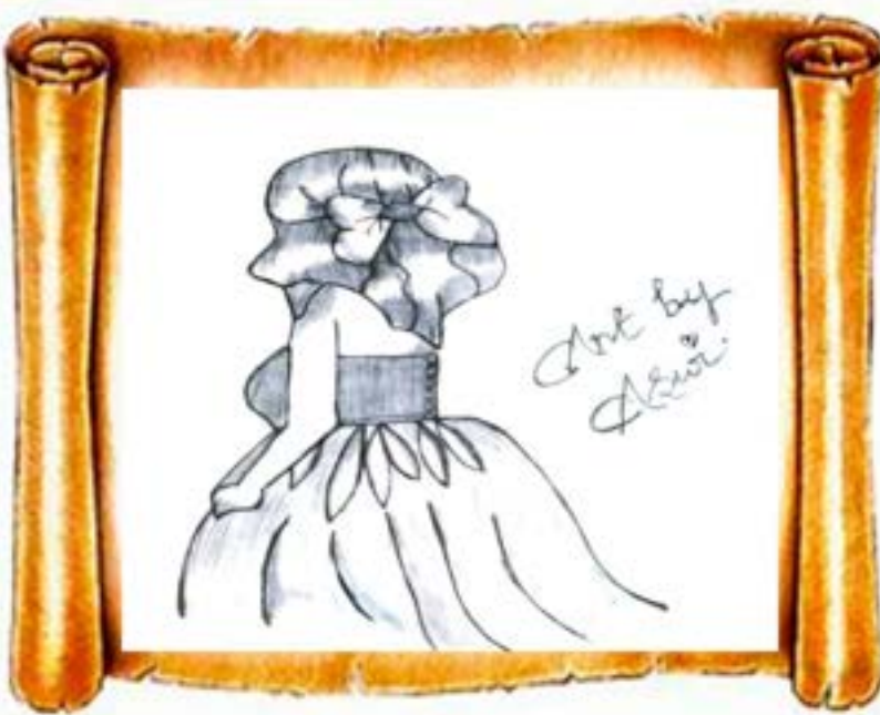
P.Aswitha 4/4 EEE -B