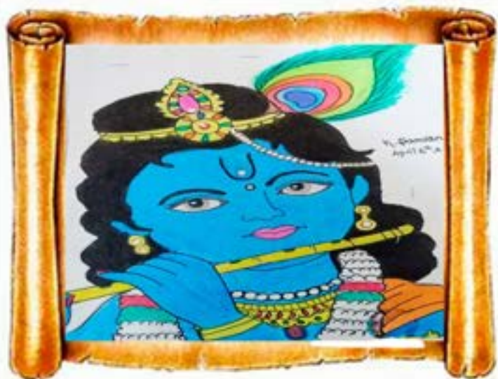
K.Saravani 4/4 EEE -A