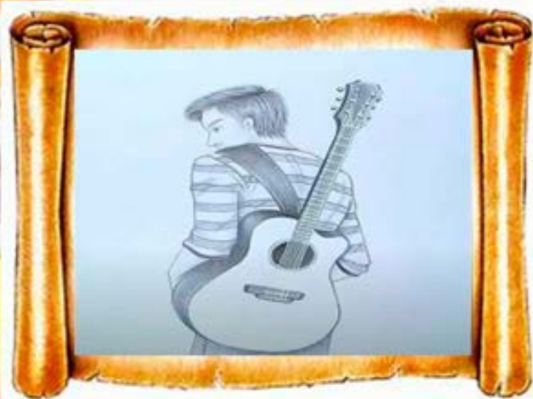
B.Raviteja 4/4 EEE -A