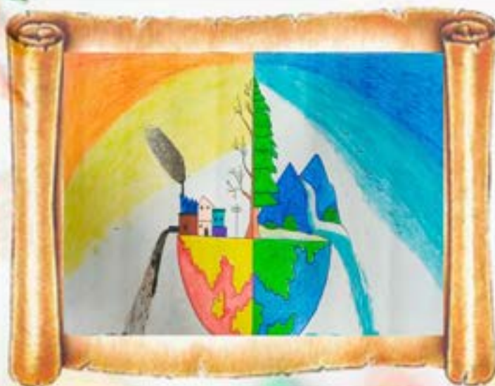
G.Vanaja 2/4 EEE -A