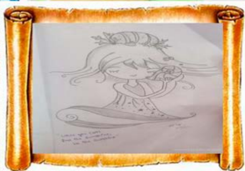
M.Nissela Margarate 2/4 EEE -A