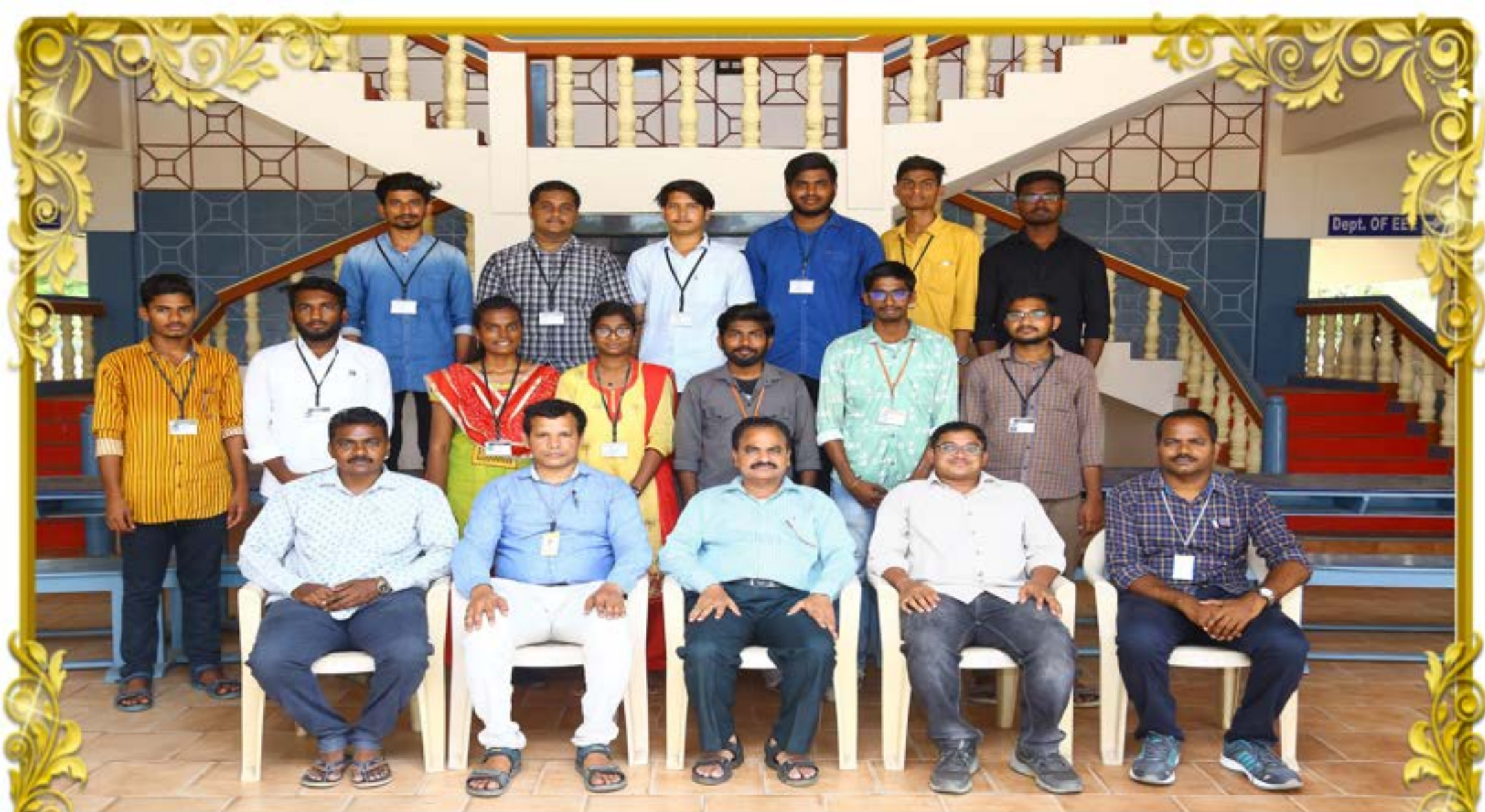
EDITORIAL MEMBERS DEPARTMENT OF EEE BAPATLA ENGINEERING COLLEGE BAPATLA