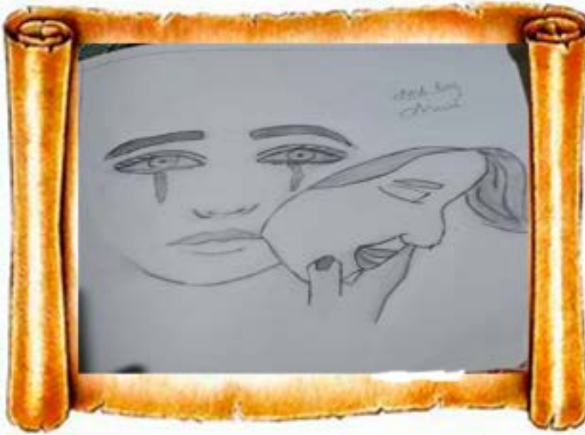
P.Aswitha 4/4 EEE -B