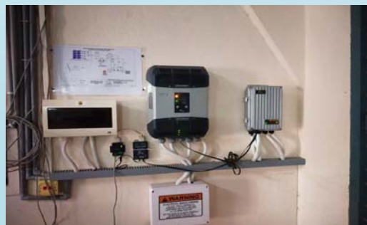
Advanced Power Systems Lab