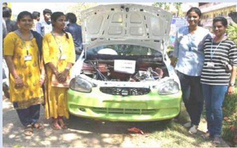
Students designed electric vehicle with Department Resources