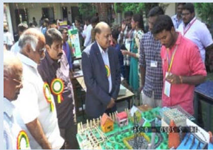
Students presents their Models in BECTAGON