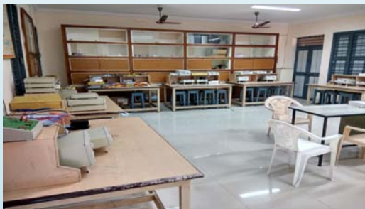
Electronic Devices and circuits