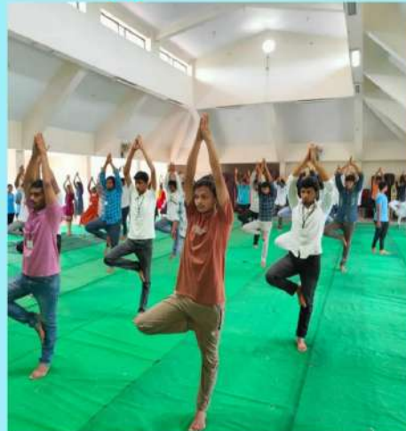
International Yoga Day Celebrations