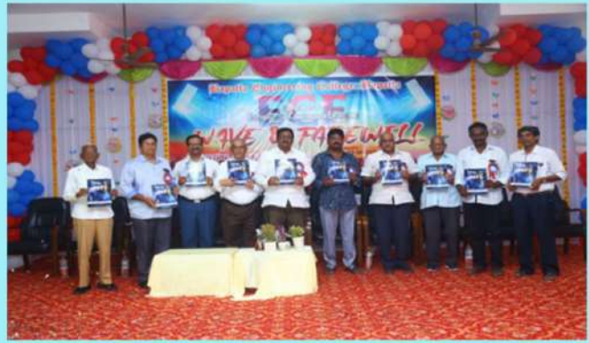
Launching of Departmental magazine