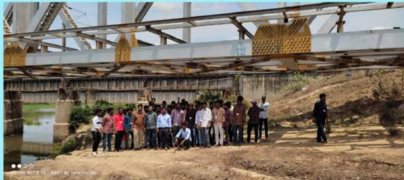
A field visit to steel truss and girder bridges near Vedullapalli, Bapatla on 27th May, 2022