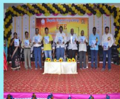
Releasing of EEE Association Magazine and Fare Well Celebrations to final year students