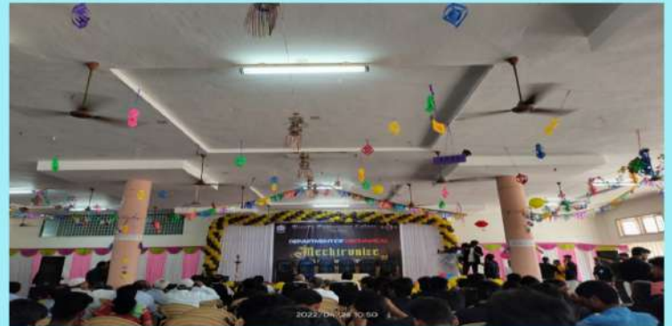
'Mechatronic' magazine release function