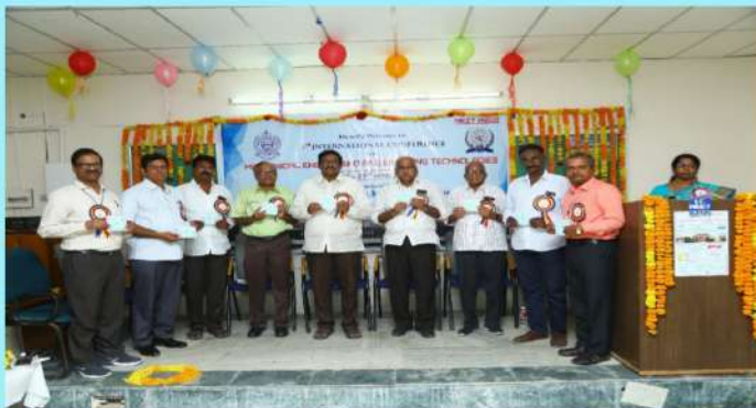
As part of Two-day International Conference on "Mechanical Engineering and Emerging Technologies (MEET 2022) Releasing Proceedings of ICMEET by the dignitaries on 22.4.2022