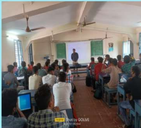
One month Technical training conducted for final year students from 27th June, 2022 to 23rd July, 2022