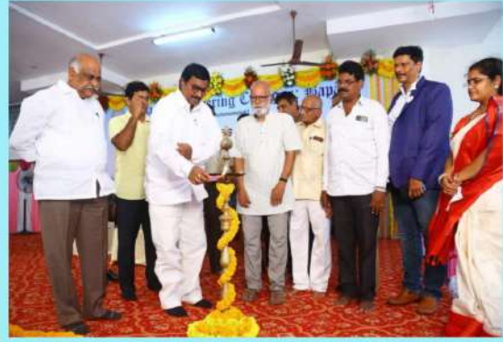
BEC--- Alumni Meet