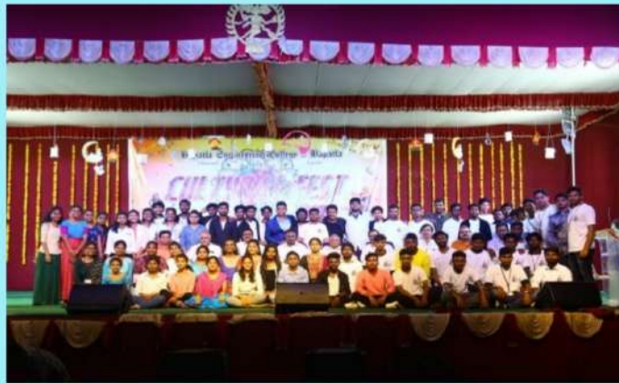
Celebration of Cultural Fest 2k22 on 23th April, 2022