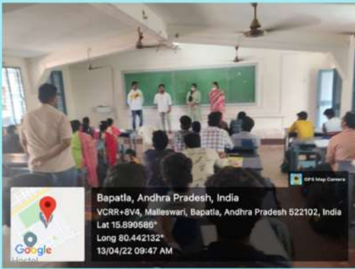
Interaction session—Seniors & Juniors of ECE