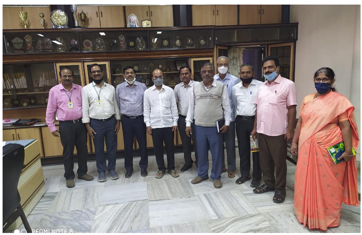
Group Photo During ISO Visit