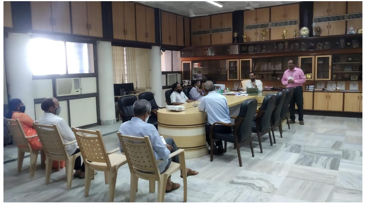
IQAC Convener remarks during exit meeting of ISO audit