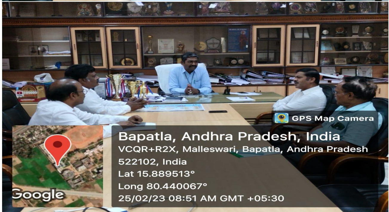
ISO expert audit team interaction with Principal and Convener -IQAC