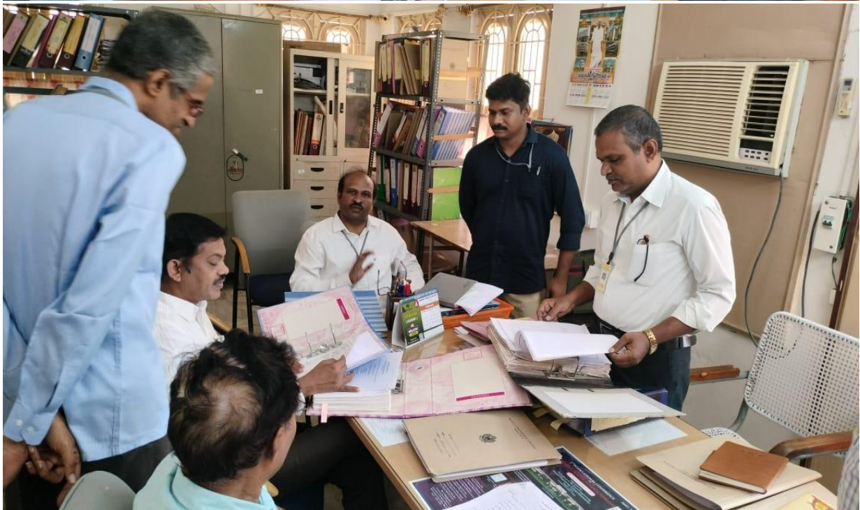
ISO Audit team verified the documents in Mechanical Engineering Department