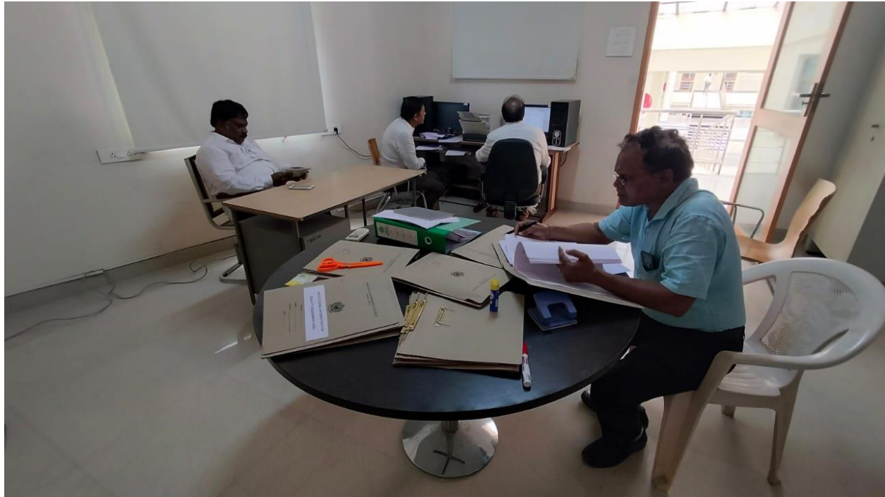
Documents Verification - IQAC Chamber