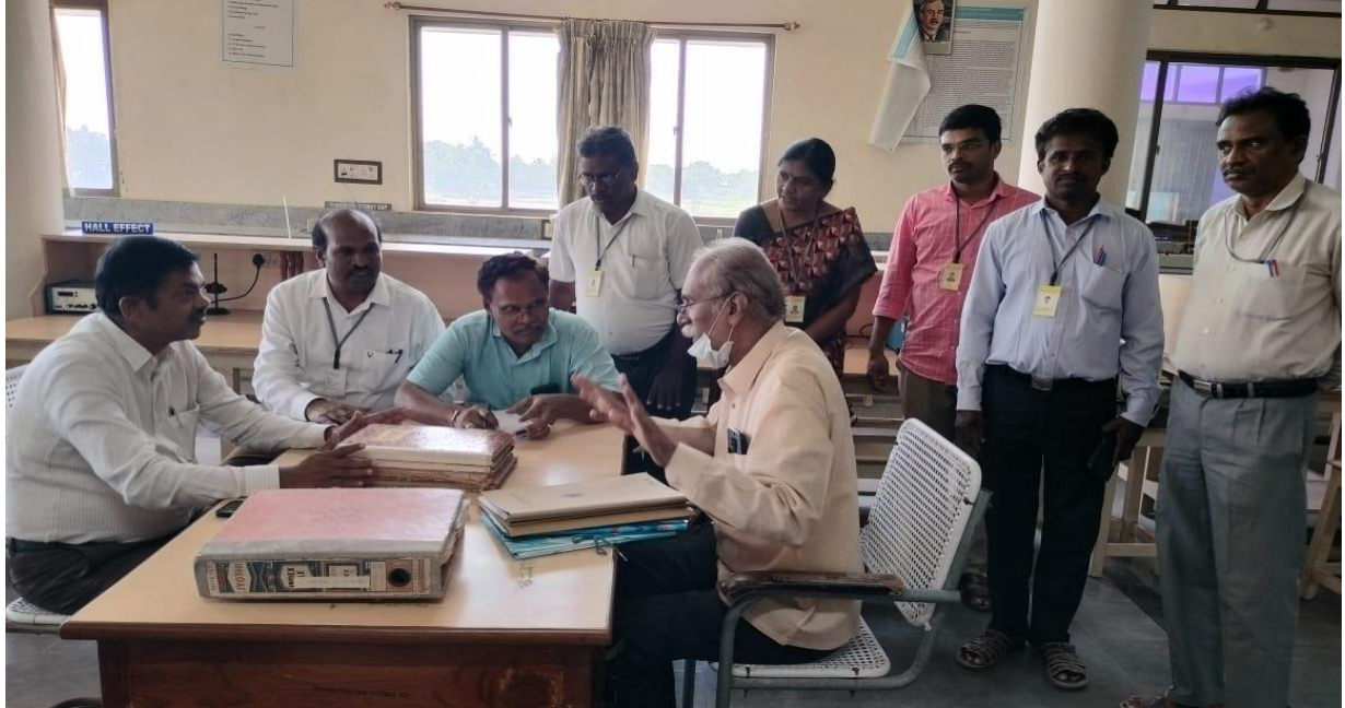
ISO Audit team verified the documents in Physics Department