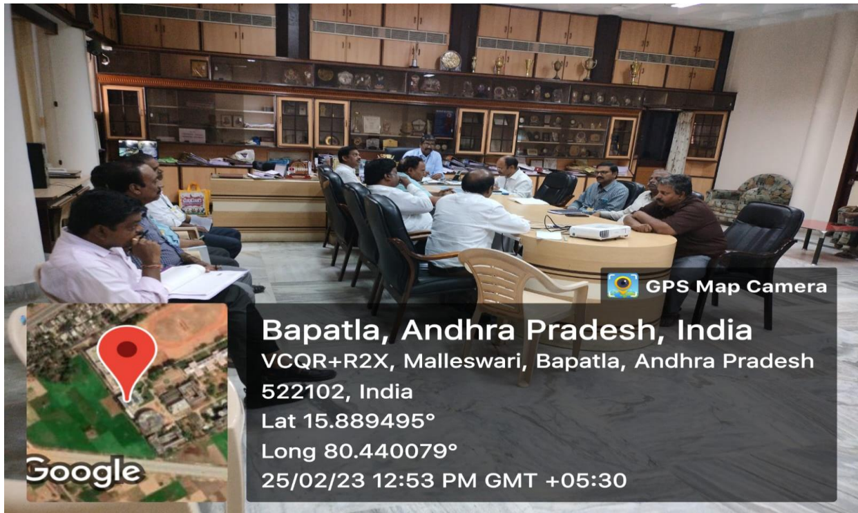
Exit Meeting with Principal, Deans, HoDs, Convener - IQAC