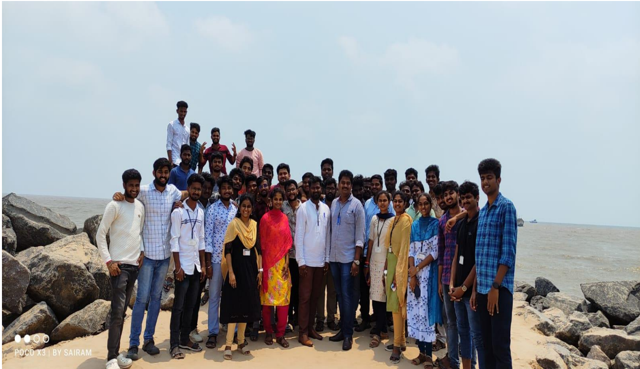
A field visit to Nizampatnam Harbour, Bapatla District, with outgoing students on 31-03-2023.