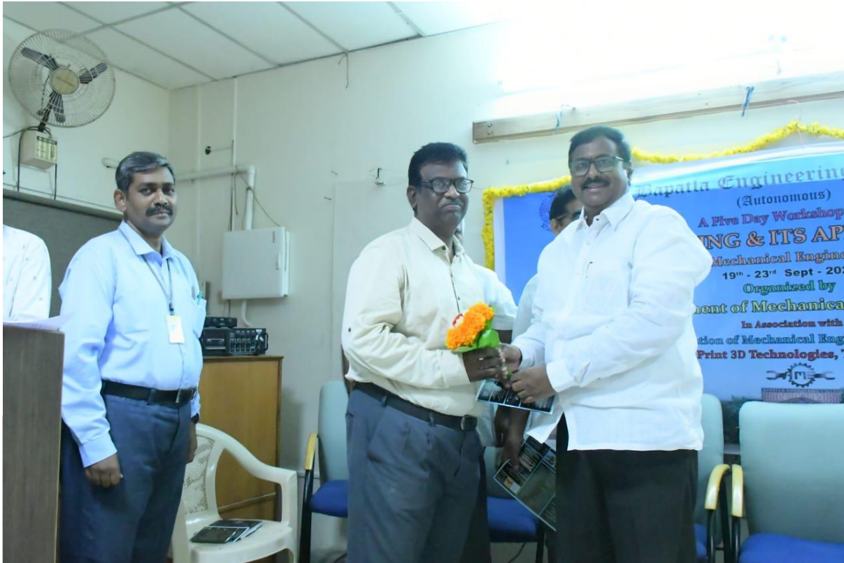
A Three Day workshop on “ Applications and Importance of NDT in various industries” during 07, July, 2023, to 09 July, 2023