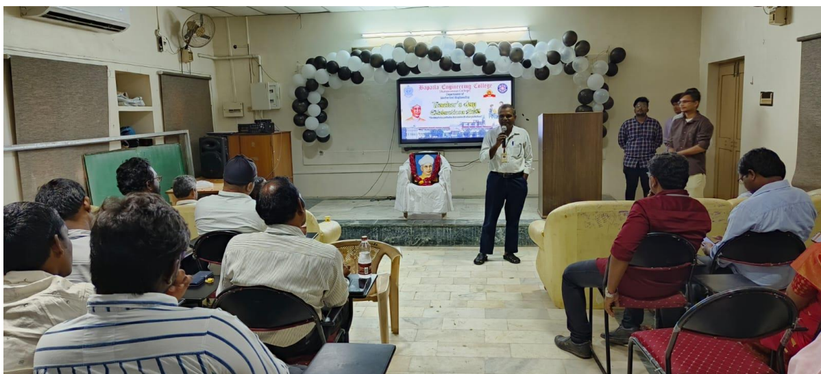
Teacher's day was celebrated on 5 th September 2023